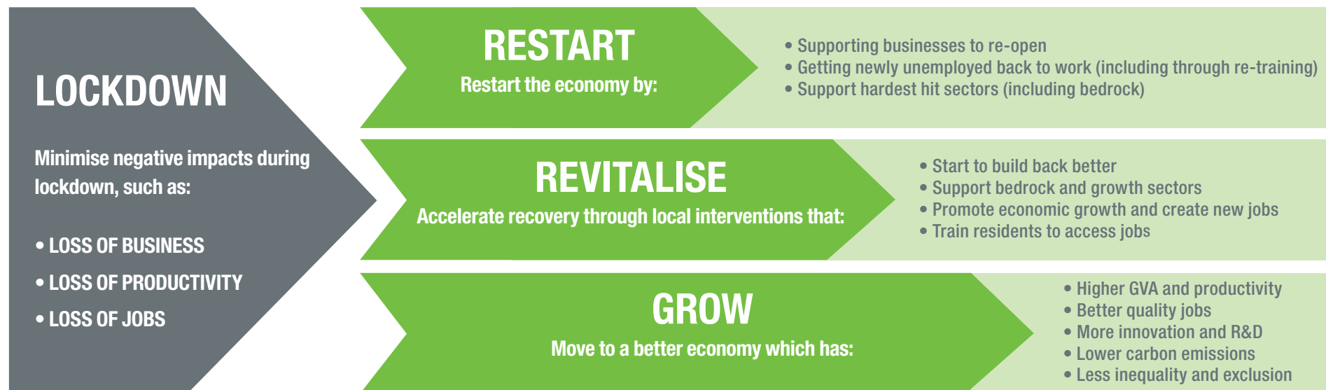
Figure 2: The Phases of Recovery

Given the rapidly changing nature of the situation, this route-map will be a live document and updated on a quarterly basis for the foreseeable future. As part of that process we will also ensure that it aligns with emerging national and local recovery plans, including cross-LEP.